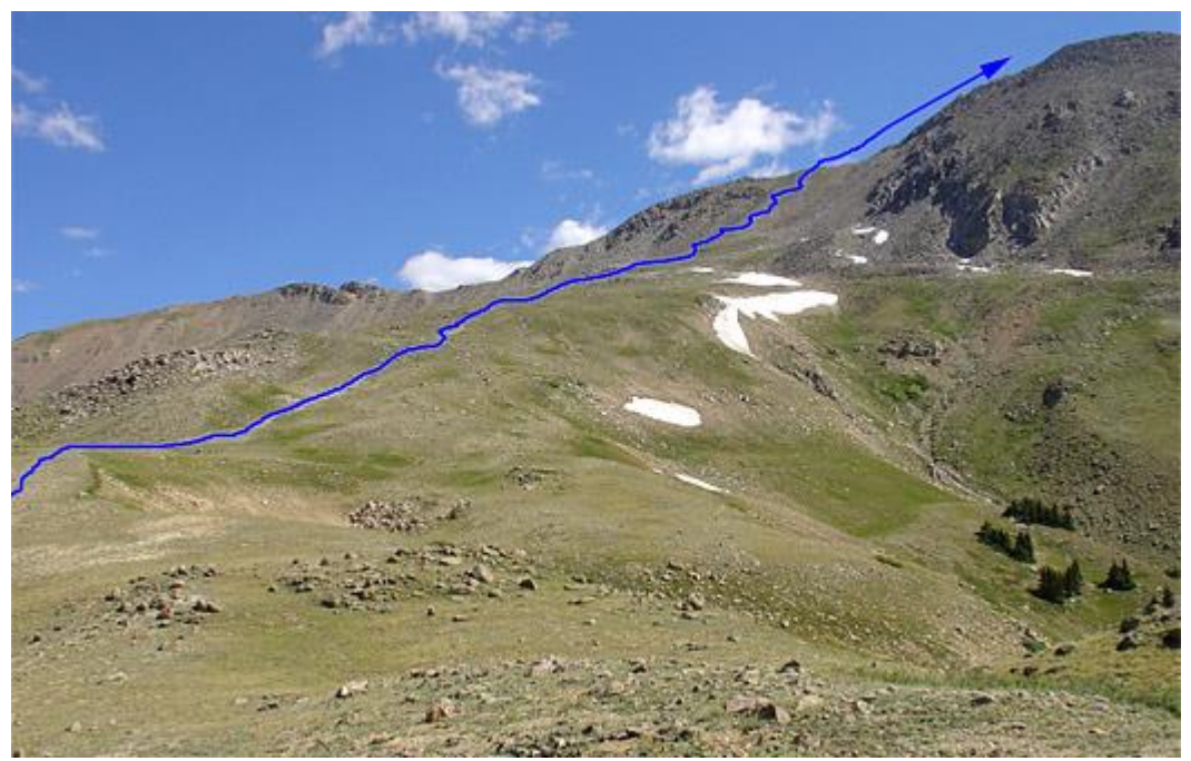
Near 12,100' about halfway up, viewing the remaining hike to the summit ridge.

From 11,300' to 11,900', we hiked northeast and then east through the forest. We left the trees at 12,000' and continued east as the trail approached a large shoulder. Once on the shoulder, the trail turned northeast toward Yale's upper west slopes. The remainder of the route was then visible.