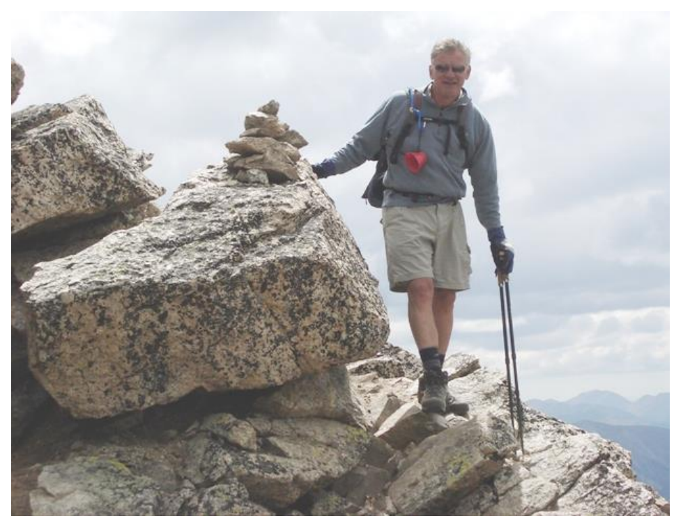
Passing a "cairn" – a pile of rocks used to show the way when no route is visible.