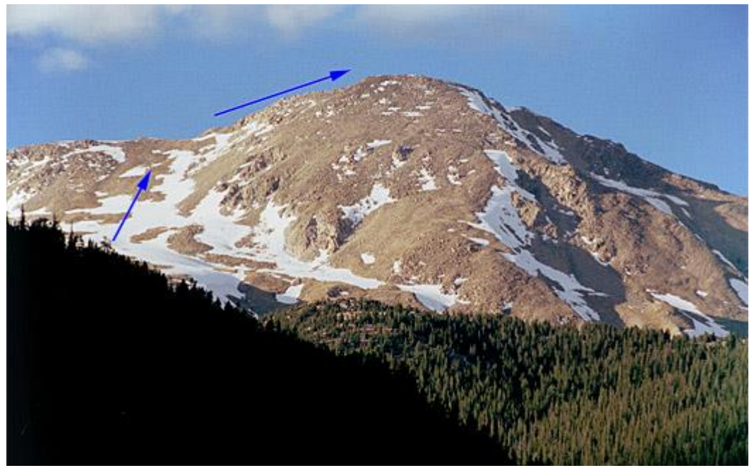
Upper portion of the route to Yale Mountain peak seen from County Road 306

Climbers: Brett Crandall and Amos; Rick Crandall and Emme