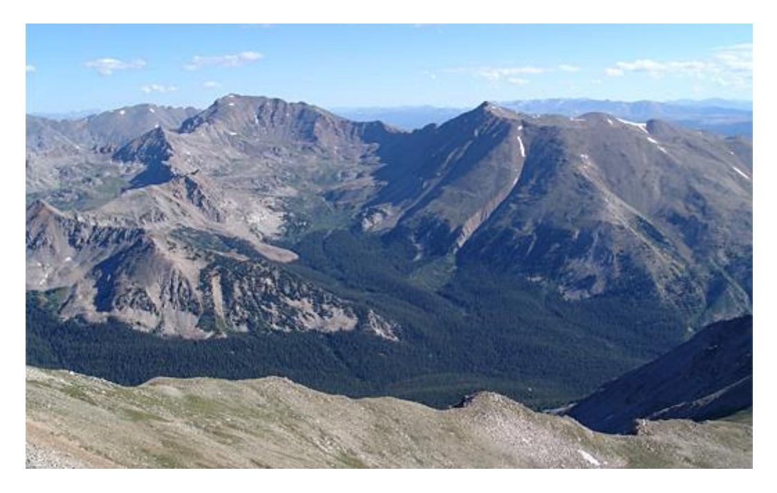
On the summit, looking north to Mt. Harvard and Mt. Columbia (right) also 14ers.