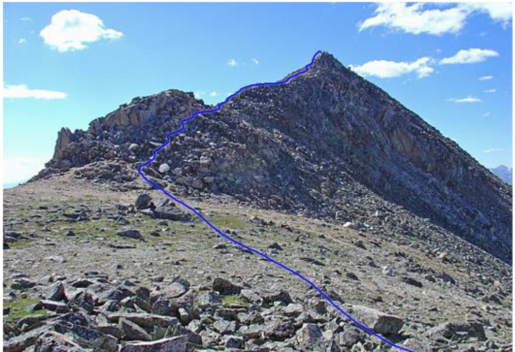
The summit ridge seen from 13,900' on the saddle. The summit is not yet visible. The last 1.5 miles to the summit is steep and slow going.