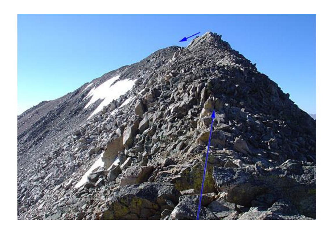
Near 13,200', we began the steep climb up the slope to the summit. We cranked steeply up 700' of elevation gain to reach the saddle at the top of the slope (13,900') where the trail quickly disappeared. We scrambled along the ridge crest by working along either side of the ridge.